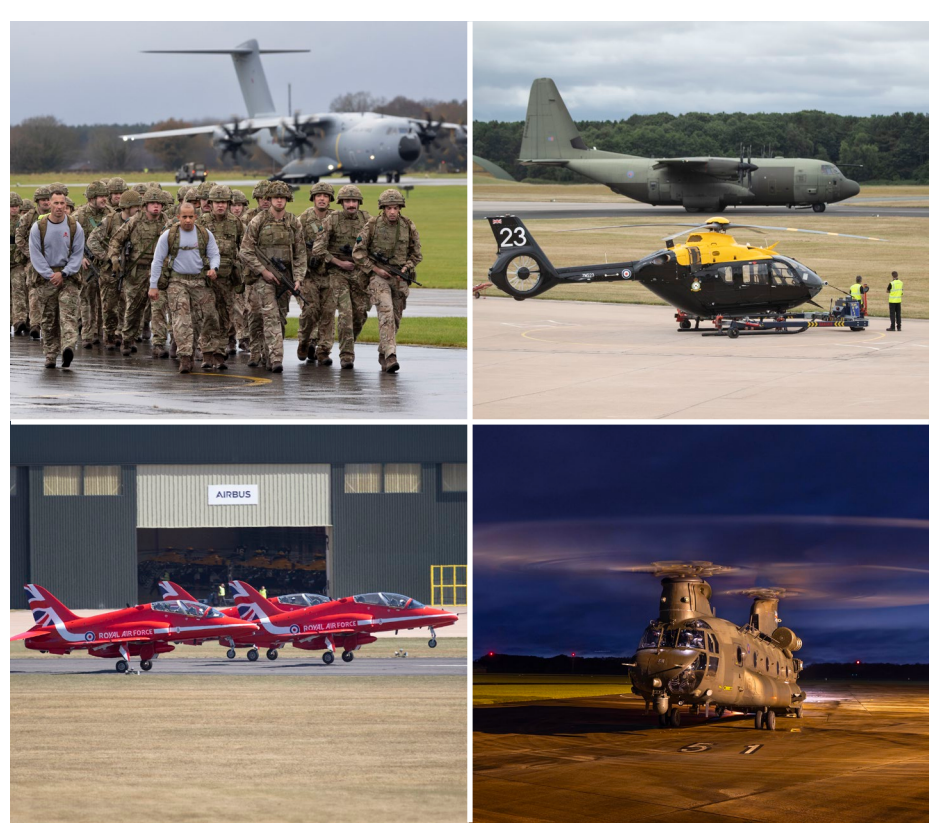
RAF Shawbury supporting front line training aircraft and the RAF Cosford Air Show