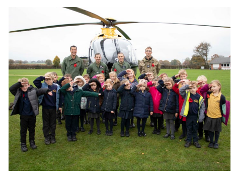
The STEM team visiting a local primary school

RAF Shawbury is justifiably proud of the support it provides to Cadet Forces. In 2023, the proactive Air Cadet Liaison Team organised four shooting events, five weeks of Annual Camp and 39 other events, which involved a total of 1123 cadets and Cadet Force Adult Volunteers. The Station also continues to inspire young people across Shropshire and neighbouring counties through its STEM programme, with No 1 FTS dedicating 63 hours of static aircraft in support of outreach visits. On six occasions aircrew landed the Juno in local playing fields to engage with children and young adults, fostering young peoples' interests in aviation, engineering, and Defence.