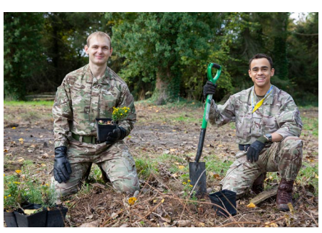
Hunkington Bee Community Project

support our neighbours, RAF Shawbury courses undertake community projects. We see this as an important aspect of the trainee's personal development and to contribute where we can to our neighbours, near and far. During 2023, some 18 community projects were undertaken, ranging from village litter picks to supporting a significant habitat restoration on an historical site. The Praise Bee Hunkington Manor Project is a remote medieval moated site, with some areas not accessed for 500 years. Our trainees cleared overgrown areas and planted over 1400 indigenous plants and flowers to develop a natural habitat for wildflowers and wildlife.